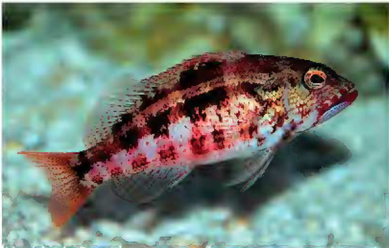
FIGURE 10. Serranus sp. from Ghana.